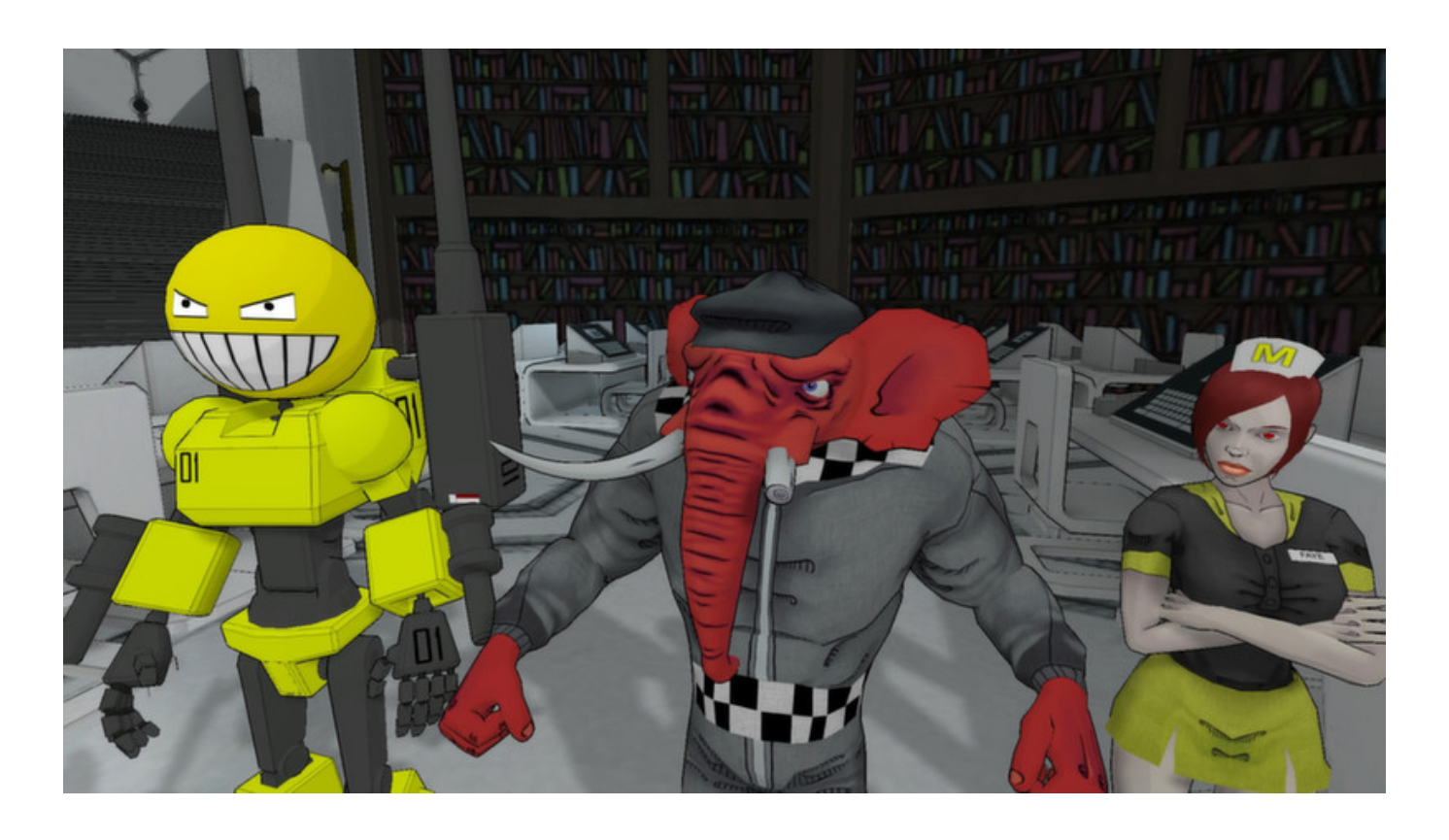
Tabletopia - The Networks Crack By Razor1911 Download

Download >>> <a href="http://bit.ly/2SKA7oK">http://bit.ly/2SKA7oK</a>